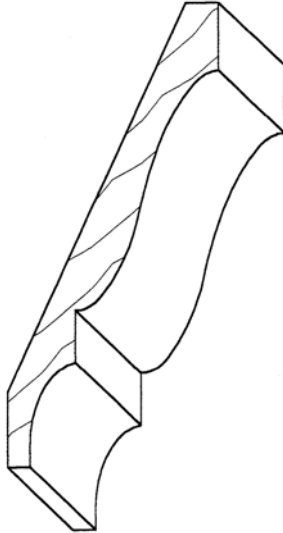
PM-17 (6")REG PM-47 (5") REG& XXTRA PM-49 (4") REG&XXTRA CROWN

THESE PROFILES ARE IN-STOCK IN REGULAR AND/OR X-FLEX