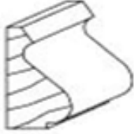
PM-163 BASECAP REG & XXTRA