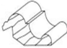
PM-43 PANEL MOULD REG & XXTRA