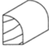
PM-127 SHOE MOULD REG & XXTRA